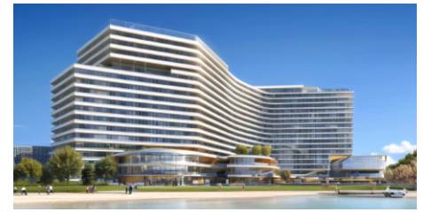
Hospitality & Property